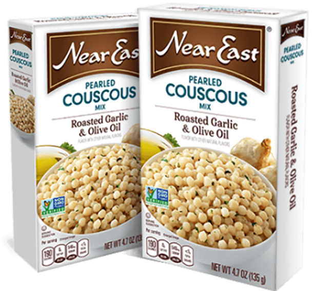
Near East® Roasted Garlic & Olive Oil Pearled Couscous