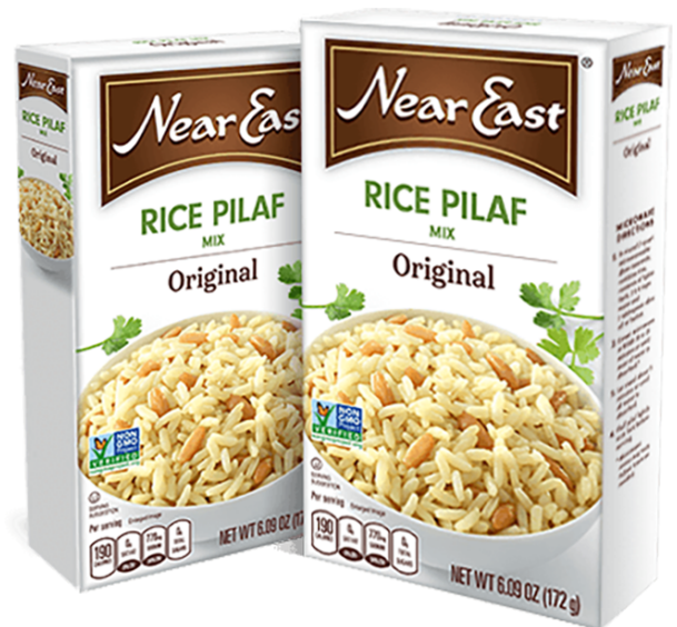
Near East® Rice Pilaf Mix