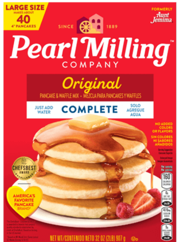
Original Complete Mix