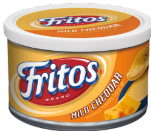
Fritos® Mild Cheddar Cheese Dip