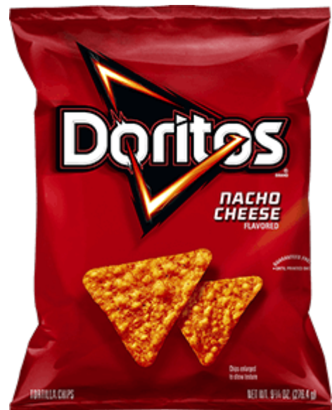
DORITOS® Nacho Cheese Flavored Tortilla Chips