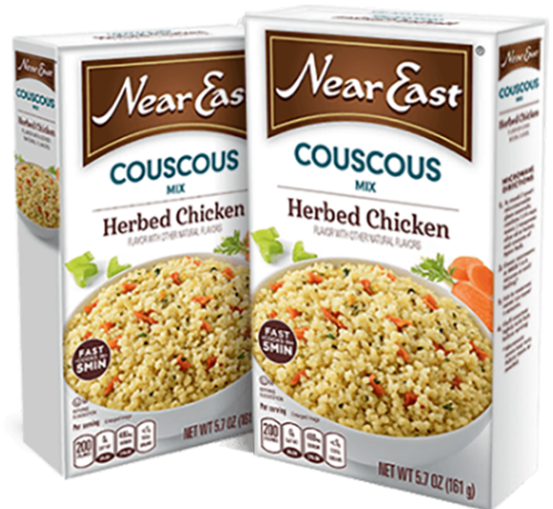
Near East® Herbed Chicken Couscous