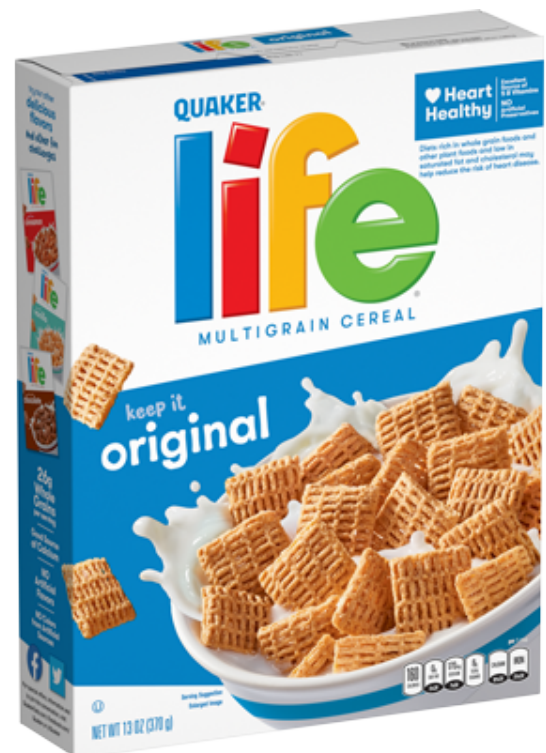
Life Cereal - Original