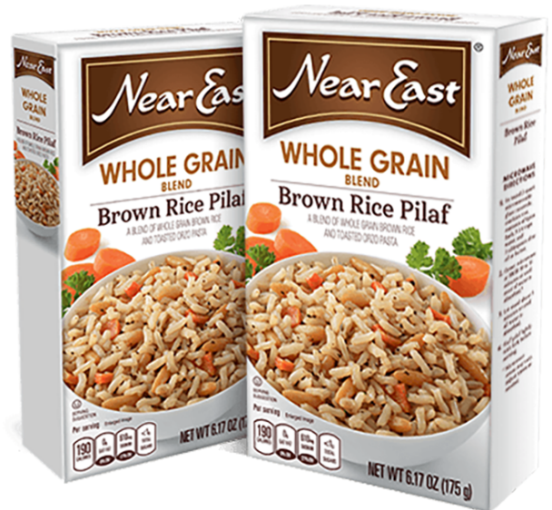
Near East® Brown Rice Pilaf Mix