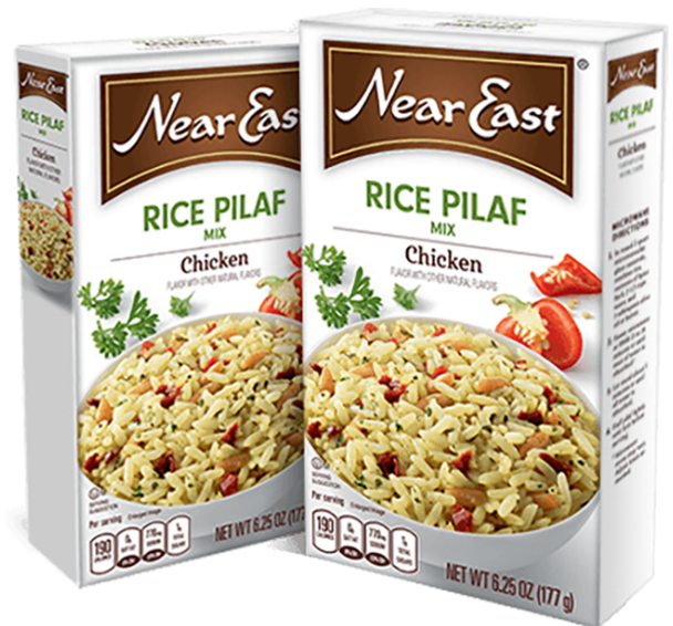
Near East® Chicken Pilaf Mix