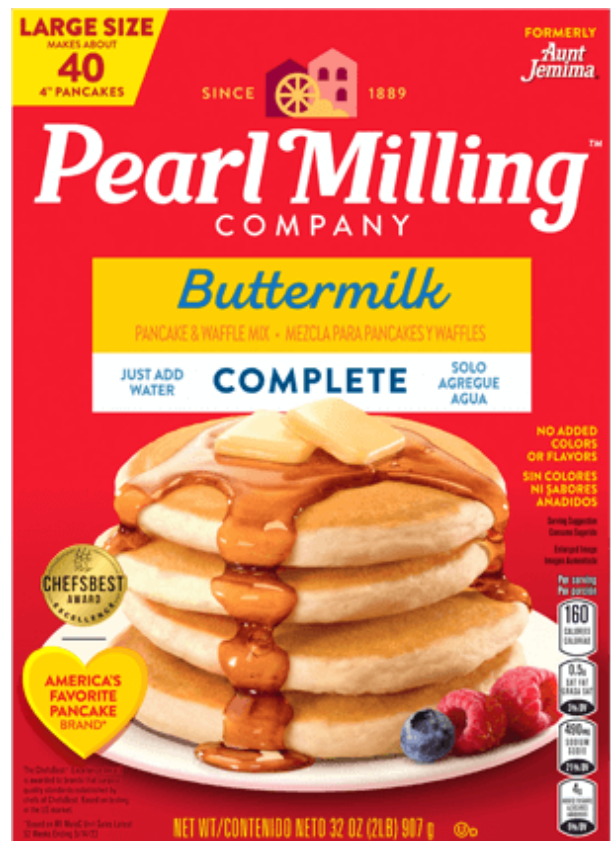
Buttermilk Complete Mix