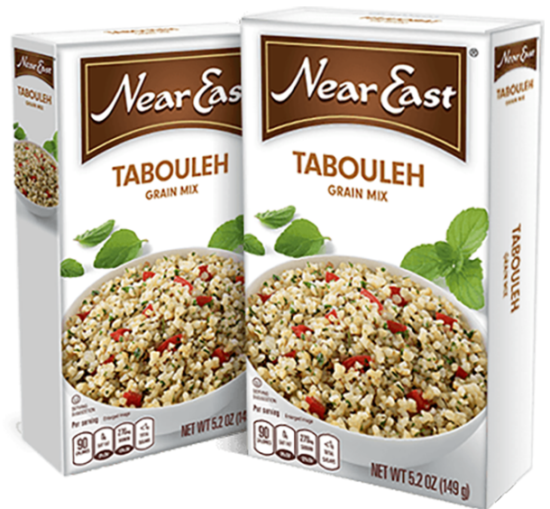
Near East® Tabouleh